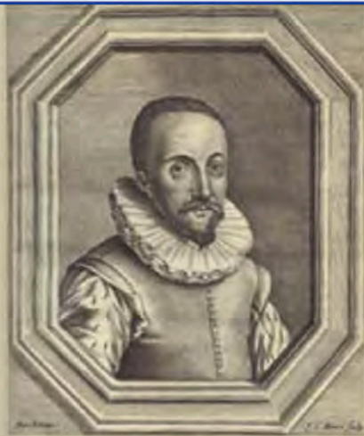
HANS LIPPERHEY. inventor of the telescope.